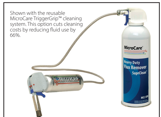
Shown with the reusable MicroCare TriggerGrip™ cleaning system. This option cuts cleaning costs by reducing fluid use by 66%.

Discover Perfectly Clean www.MicroCare.com